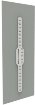
COMBINATION 02 - Ref. 09 415 02 02