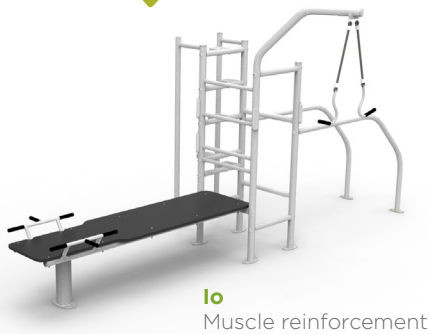
lo Muscle reinforcement